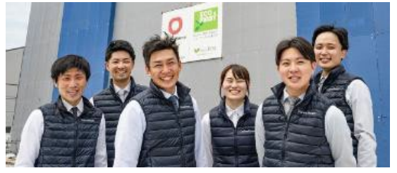
Uniform for Employees / Students